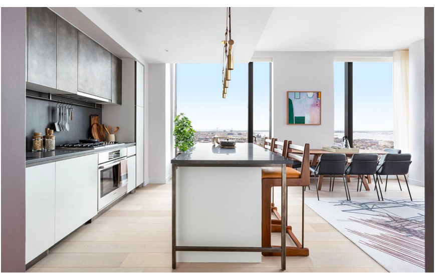
A kitchen and living area in Brooklyn's luxury residential development, 11 Hoyt, with interior design by Michaelis Boyd

A new residential development – 11 Hoyt – in downtown Brooklyn, New York, intertwines industrial-inspired design codes with vast square footage for a comfortable and contemporary new living space. Manhattan-based real estate company Tishman Speyer has created 481 generously proportioned homes that offer both indoor and